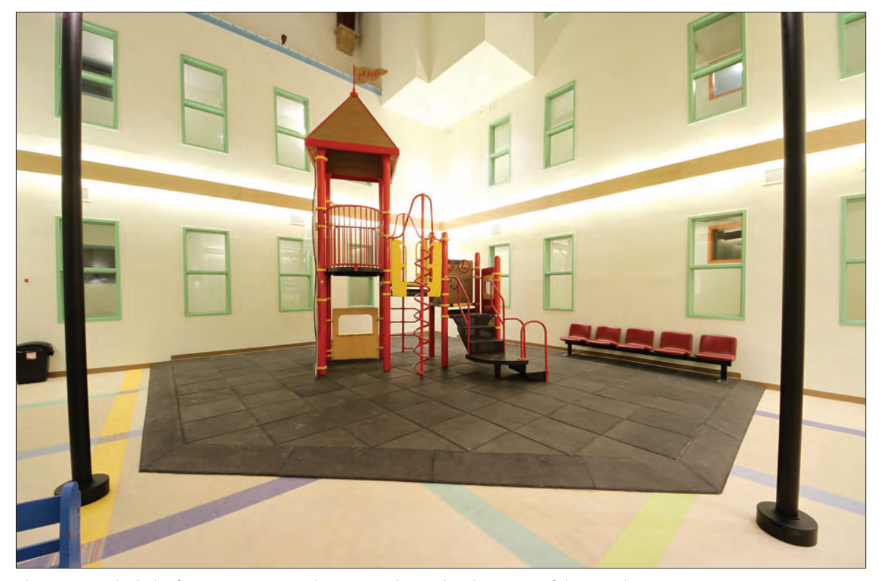
The atrium is the hub of activity at WestEnd Commons located in the centre of the complex.

responsible for coordinating programming, she prioritizes facilitating resident involvement in the planning and implementation of events and regular programs.