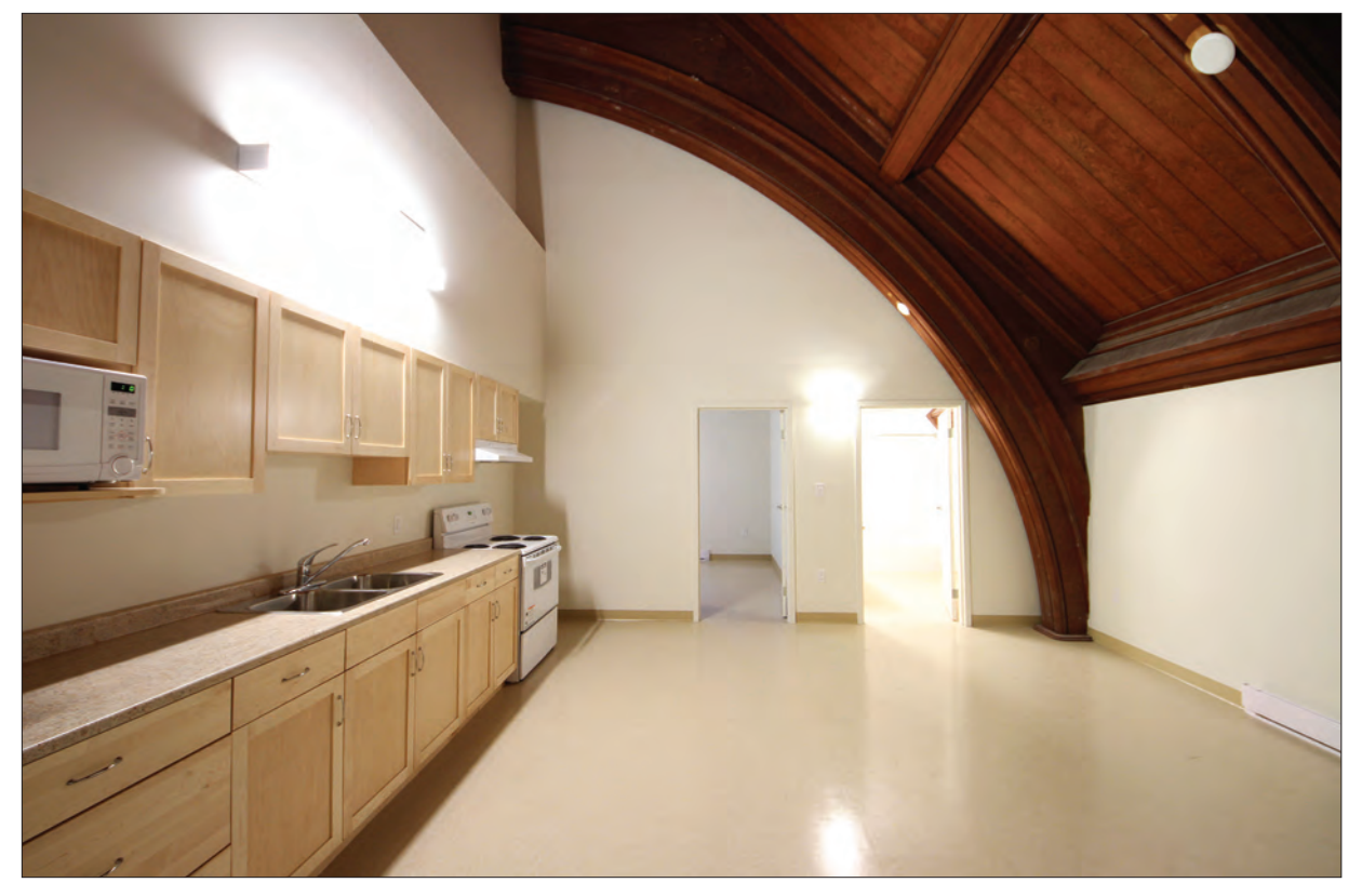
A WestEnd Commons apartment, featuring the original church ceiling.

in the fridge, we're going to save that for people who actually need it more than us. Like before we were really needy, we're not needy anymore, so we're not going to go.